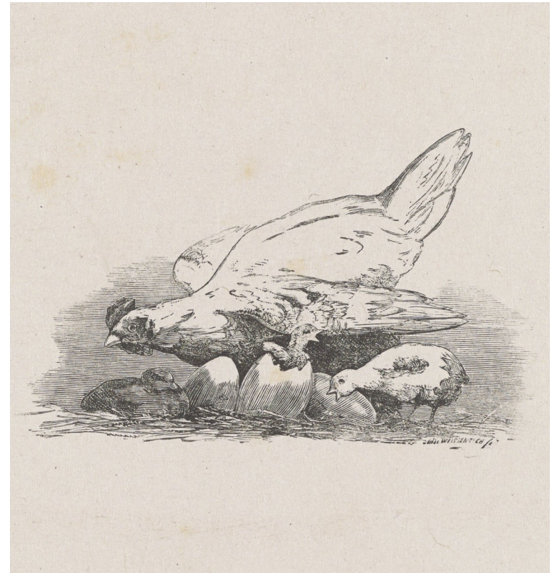
Chicken with Chicks and Hatching Eggs

And so I often stand for hours Deciding which is right— To impolitely have enough, Or starve and be polite.