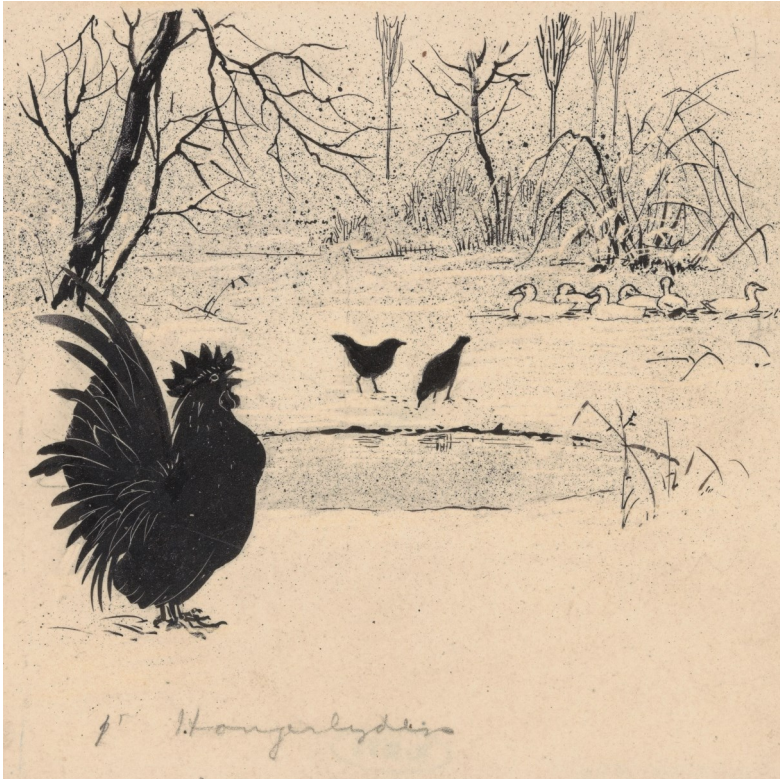
Ducks, Birds, and Rooster Near a Frozen Lake