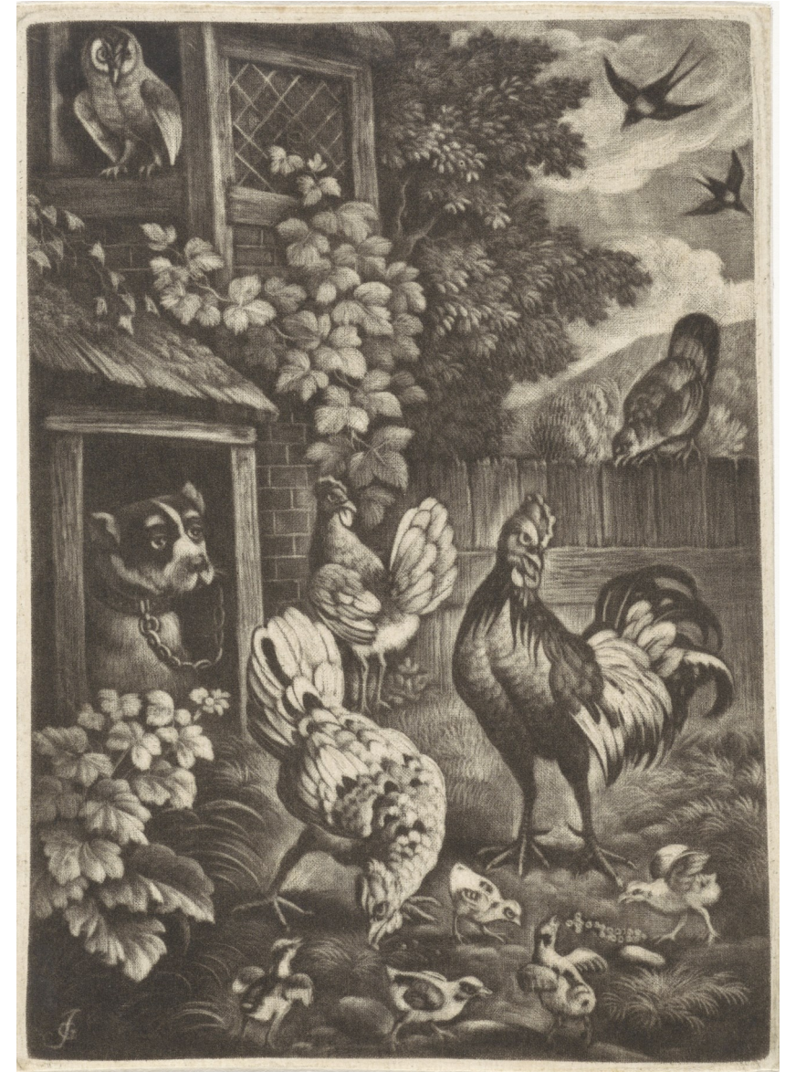
Poultry and a Dog

Now the hands of the clock we can turn ahead, We can fool the people and feel content; But the thing that worries me night and day, And on which my entire thought is bent Is, how can we fool that rooster?