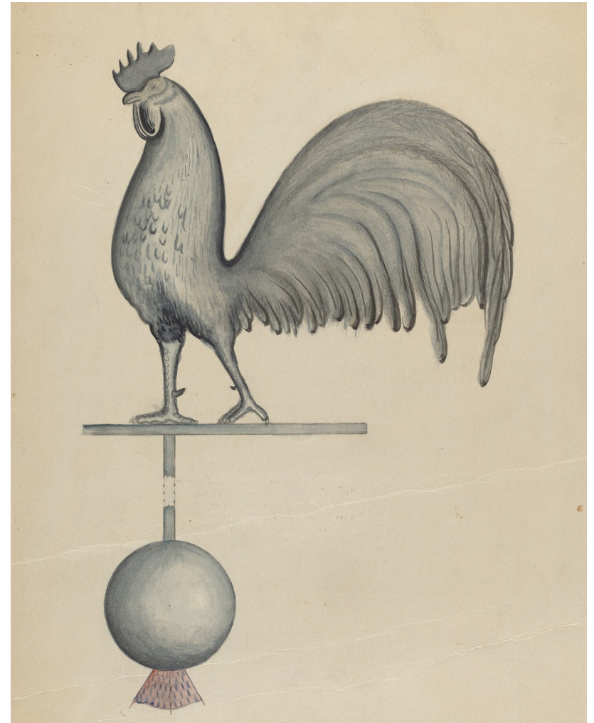
Weather Vane - Iron Rooster

Back cover art: "Two Chicks Fighting Over a Butterfly" by Ohara Koson, 1900-1910 Color Woodcut